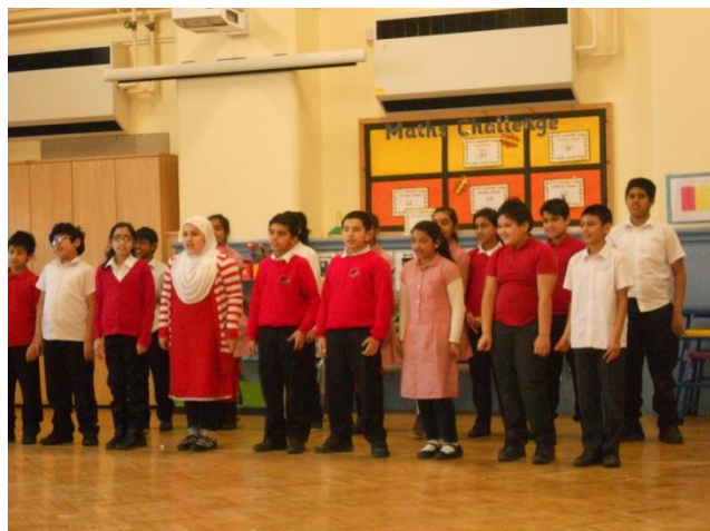
Drama Club performing for Parents

Thank you parents for supporting your child's attendance at Drama Club. We are very proud of how hard the children are working on their speaking skills.